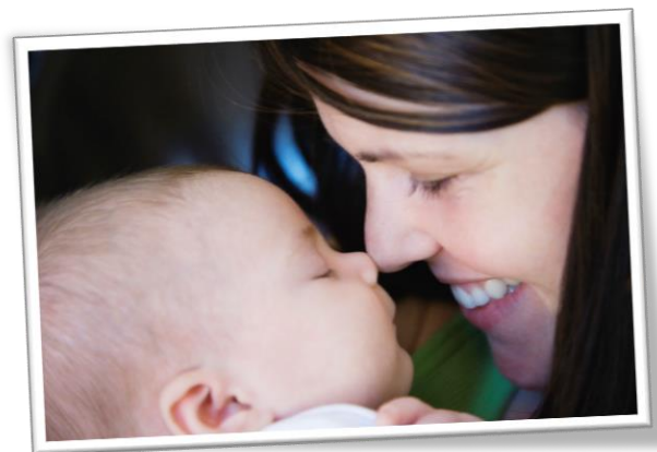
PARENTING CLASSES ARE ON-SITE EVERY WEEK. COMMUNITY COLLABORATION WITH THE "BABY PROJECT," "CARING FOR ,2" AND "BRIDGES."